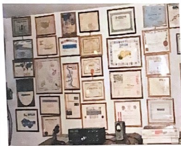
Emily's wall of awards