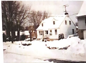
A clean beam performs in all types of weather